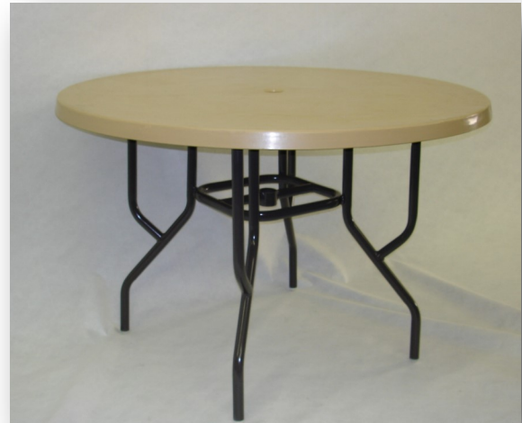
C-738F— 48" Fiberglass Top Dining Table w/ Reinforced Legs; Stackable when Disassembled