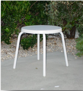
C-618F— 18" Fiberglass Side Table