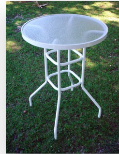
C-816A— 36" Acrylic Side Table