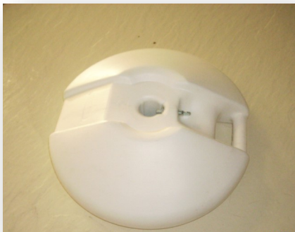
Plastic Cover Cement Base, 50 lb. Not Paintable