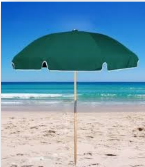
Wood Beach, No Tilt