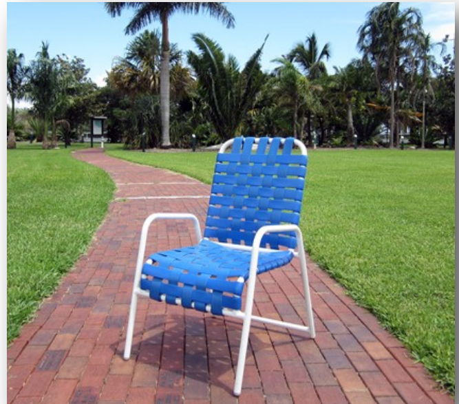
C-200X – Cross Weave, Stackable C-215X—Cross Weave, Flat Tube, Stackable