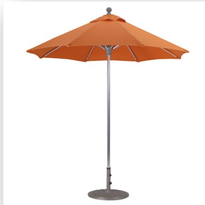
Commercial Aluminum Market, No Tilt