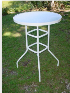
C-816F— 36" Fiberglass Bar Table