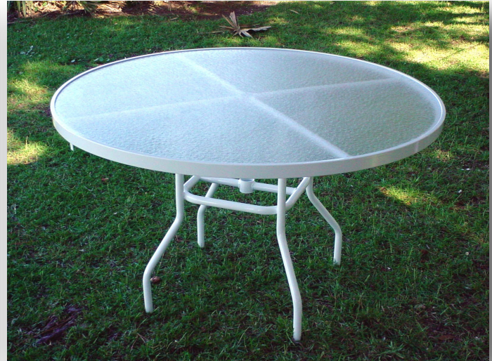
C-738A— 48" Acrylic Top Dining Table, Stackable when Disassembled