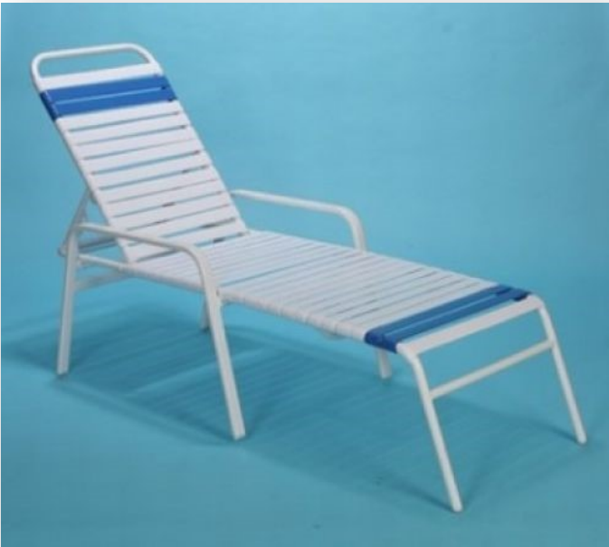
C-115H—Horizontal Strapped 16", Stackable w/ Arms