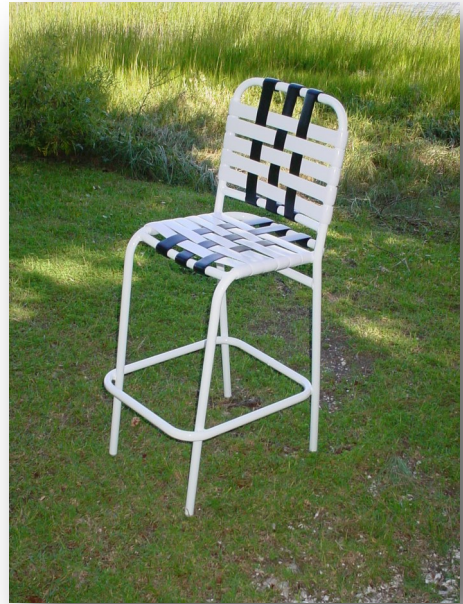
C-400X – Cross Weave Bar Stool