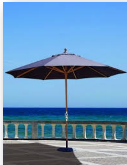
Wood Market, No Tilt

Umbrellas are available in many sizes and can be made in almost unlimited fabric colors. All umbrellas are custom made and warranted by the manufacturer for one year against defects in material and workmanship. The Commercial Market umbrella has a three year warranty against breakage.