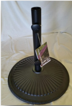
Cast Iron 50 lb. Paintable