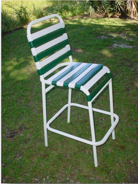
C-400H – Horizontal Strapped Bar Stool