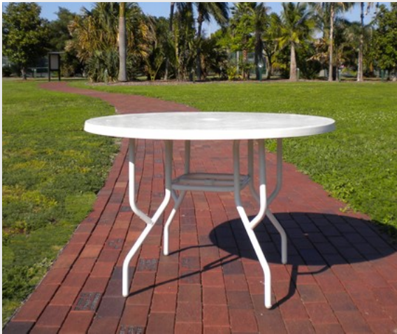
C-732F— 42" Fiberglass Top Dining Table w/ Reinforced Legs; Stackable when Disassembled