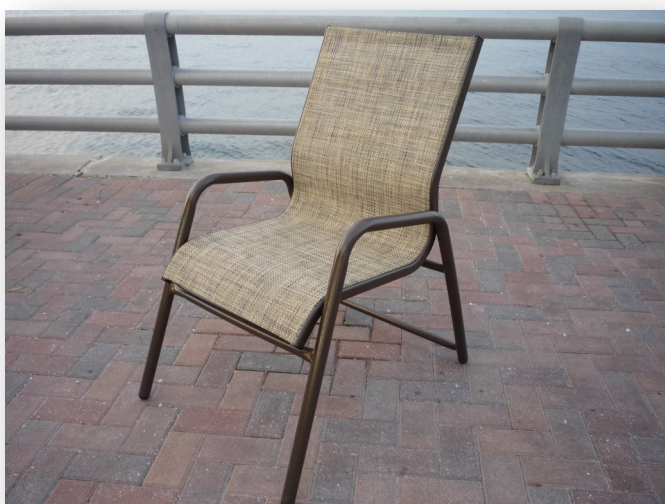
C-250S— Sling, Round Tube, Stackable