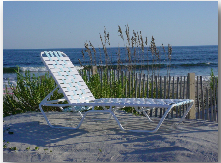
C-100X—Cross Weave 12", Stackable C-101X—Cross Weave 14", Stackable