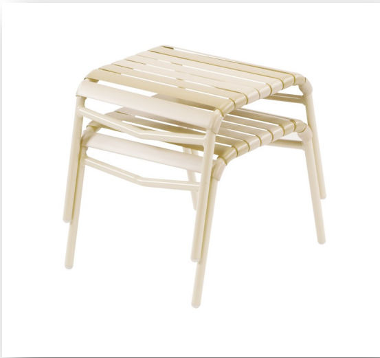
C-550H – Horizontal Strapped Ottoman