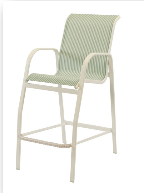
C-480S – Sling Flat Tube Bar Stool