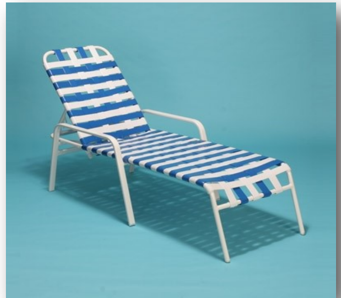
C-115X—Cross Weave 16", Stackable w/ Arms