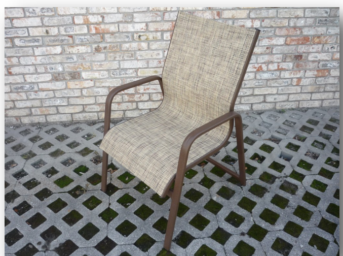
C-280S – Sling, Flat Tube, Stackable