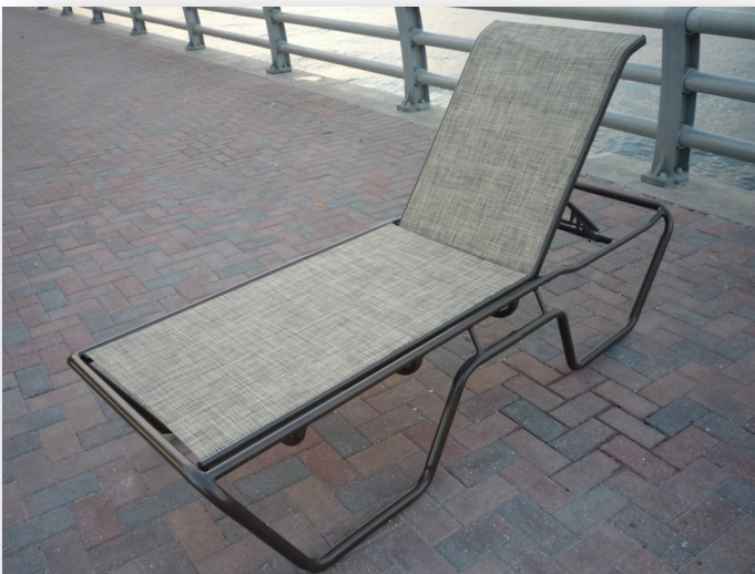
C-150S—Sling, Round Tube, Stackable