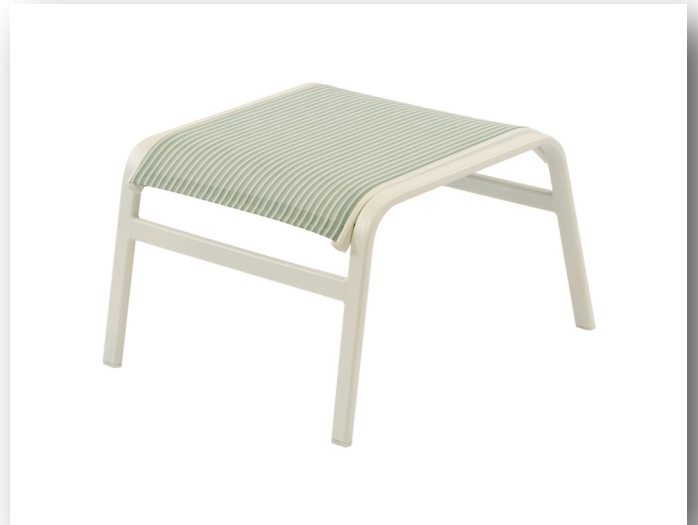
C-580S – Sling Ottoman