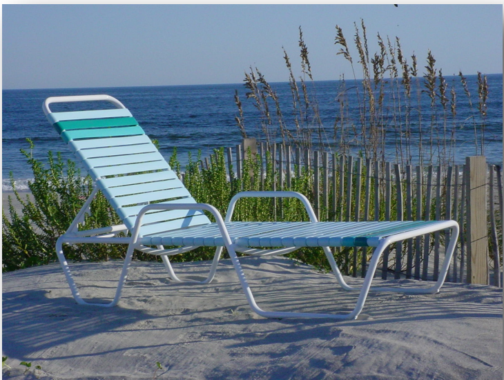
C-105H – Horizontal Strapped 14" w/ Arms, Stackable