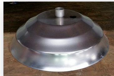
Aluminum Sand Fill 77 lb. Paintable