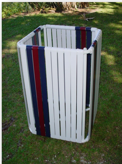
C-590V– Vertical Strapped Trash Can