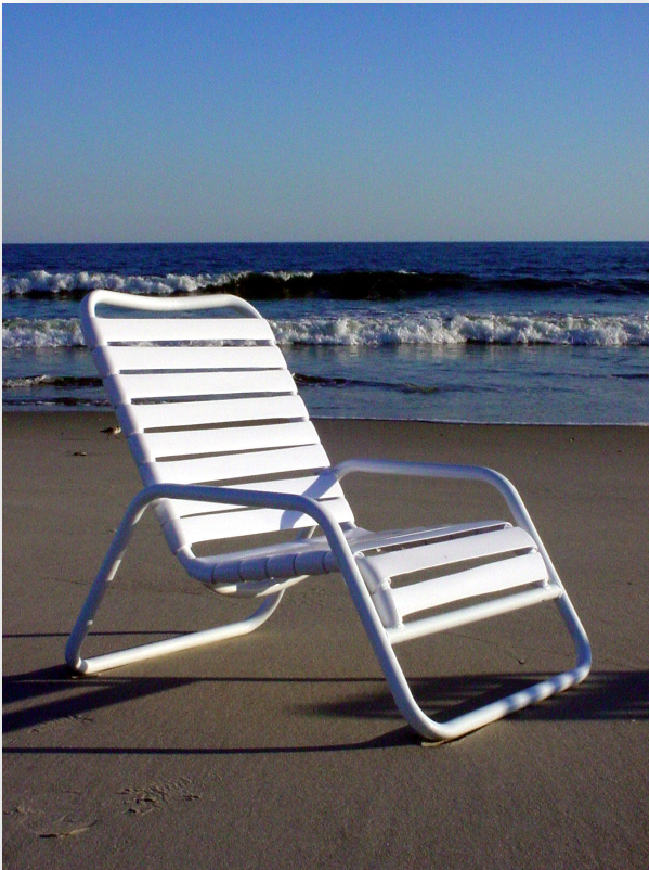
C-300H— Horizontal Strapped, Stackable