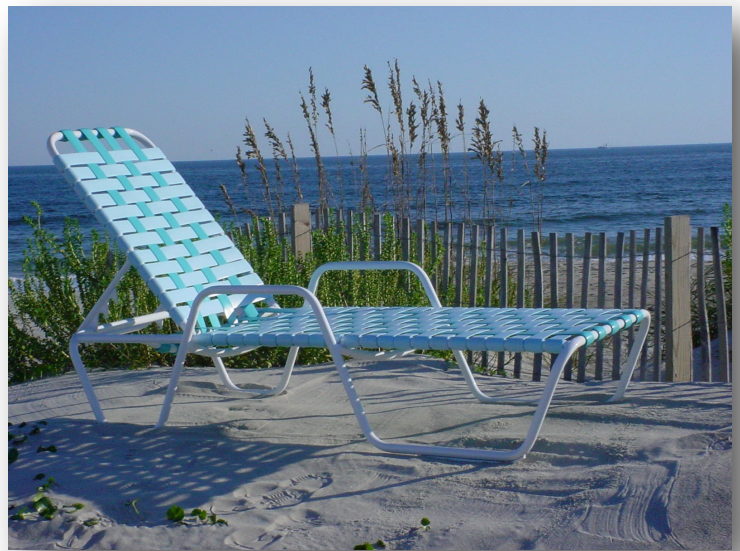
C-105X– Cross Weave 14" w/ Arms, Stackable