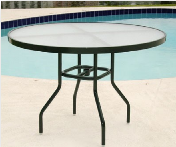
C-732A— 42" Acrylic Top Dining Table, Stackable when Disassembled