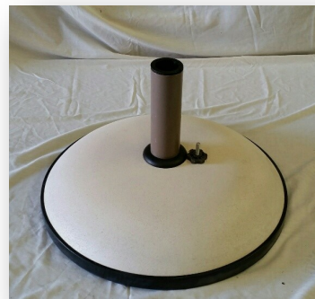
Concrete 70 lb. Paintable