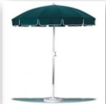
Aluminum Pop—Up, No Tilt