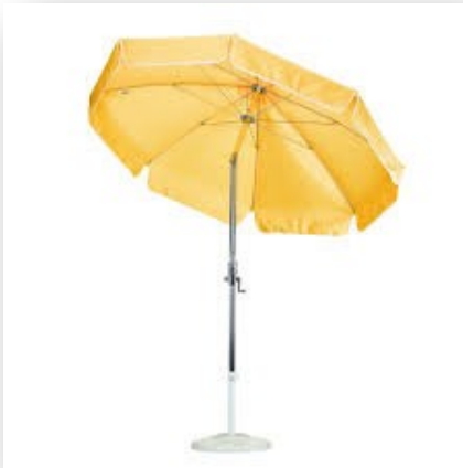
Aluminum Crank and Tilt