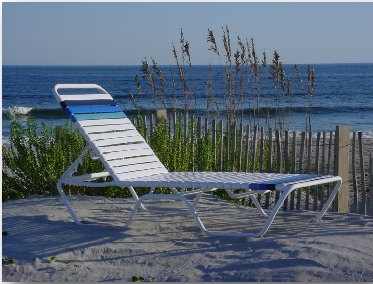
C-100H—Horizontal Strapped 12", Stackable C-101H – Horizontal Strapped 14", Stackable