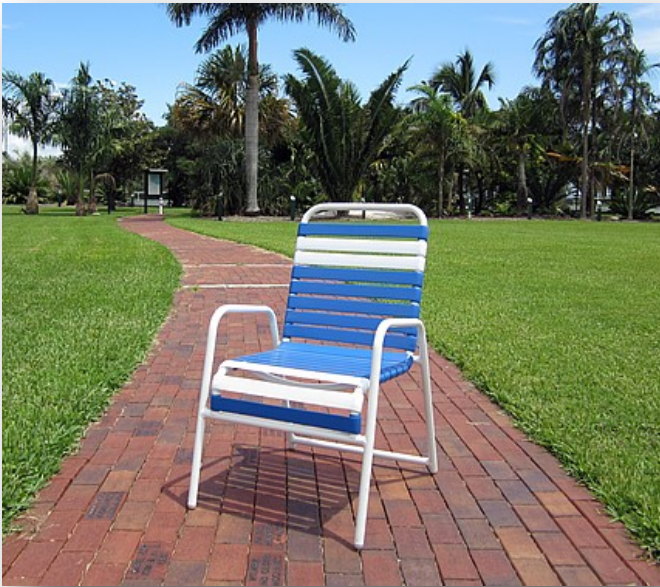
C-200H – Horizontal Strapped, Stackable C-215H—Horizontal Strapped, Flat Tube, Stackable