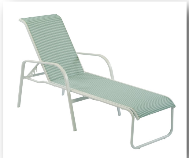
C-185S—Sling, Flat Tube w/ Arms, Stackable