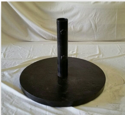
Cast Iron 100 lb. Paintable