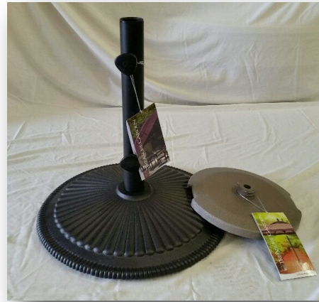
Cast Iron 50 lb. w/ 30 lb. Insert Paintable