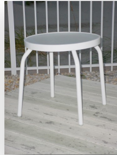
C-618A— 18" Acrylic Side Table